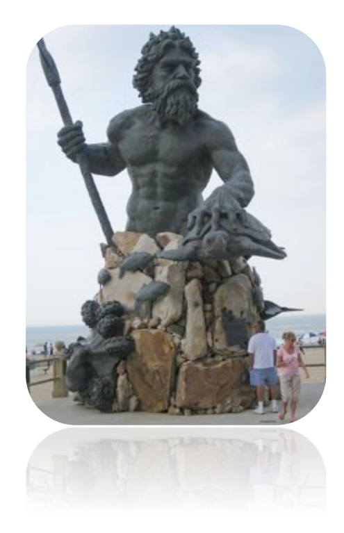
Statue of King Neptune on the boardwalk at Virginia Beach

In an age when tenure of employment, and even finding a satisfactory form of meaningful employment, is increasingly difficult for most of us, the idea of finding permanent employment in God's service is a great comfort.